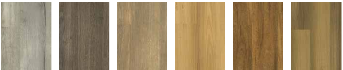
120 Rustic Oak Weathered 180 Rustic Oak Brown 515 Rustic Oak Natural 545 Northern Blackbutt 555 Spotted Gum 570 Turpentine