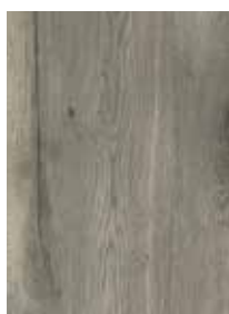
710 Rustic Oak Ash

Hinterland HB captures the natural beauty of timber with the best attributes of a laminate and vinyl flooring. The innovative Hybrid flooring delivers astonishing durability and impact resistance. With Trigon® core technology and a scratch resistance surface this beautiful and durable floor is able to withstand heavy foot traffic.