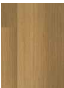
625 Flooded Gum