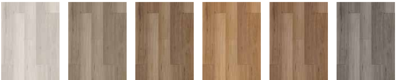
105 Creamy Blackbutt