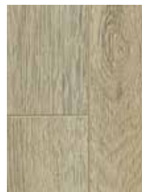
510 Italian Wash