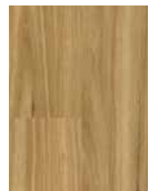
545 Stoney Creek Blackbutt