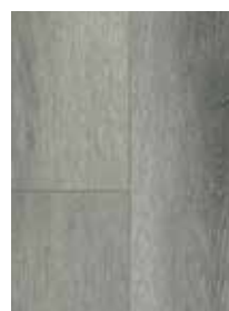
730 Fossil Grey