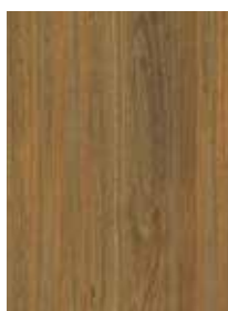
555 Coastal Spotted Gum