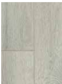
100 White Shadow