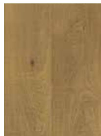
300 Hunter Oak