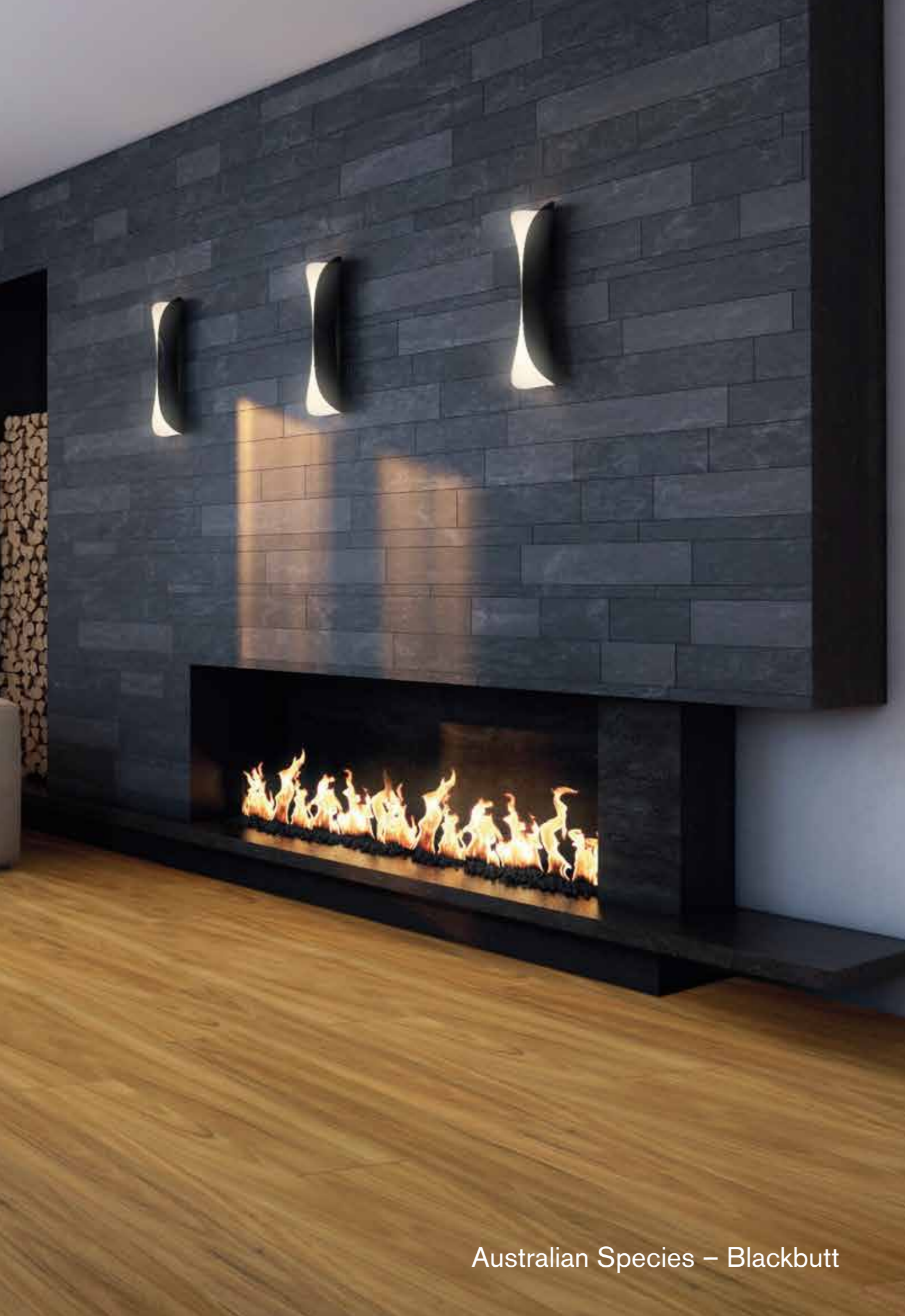
Australian Species – Blackbutt