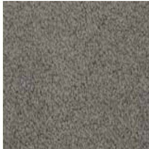
Burnished Steel 755