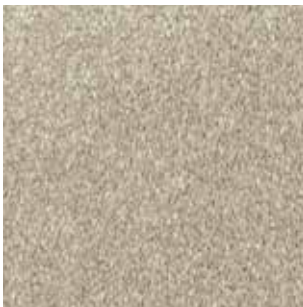
French Cream 230