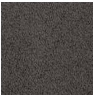
Shale Grey 760