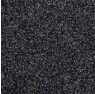
Black Leather 34