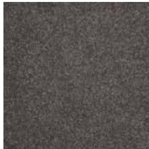
Tree Bark 28