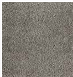
Wind Chime 93