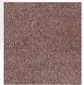
Dusty Rose 63