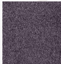
Madame Mauve 86