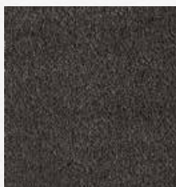
Velvet Pewter 97