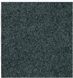
Wild Duck 27

Offering a rich colour palette, inspired by winter chai and nights by the fire, SNUG fills your winter cup with warmth and wonder.