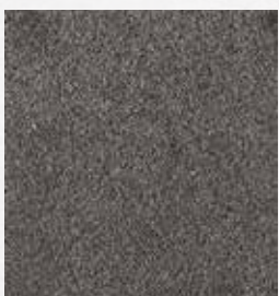
Winter Refuge 96