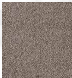
Cinnamon Sand 43