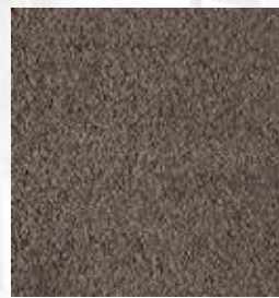
Creamy Cocoa 47