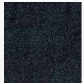
Star Trail 77