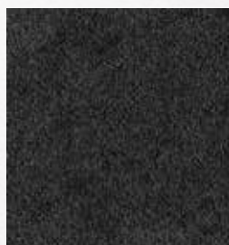
Charcoal Crackle 98