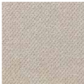
Wood Smoke TS