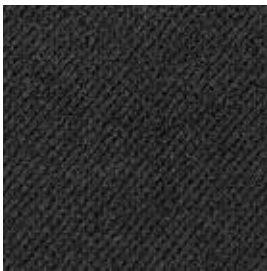
Hail Storm SC