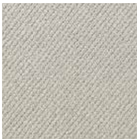
White Rhino MM