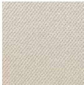
Himalayan Salt SU