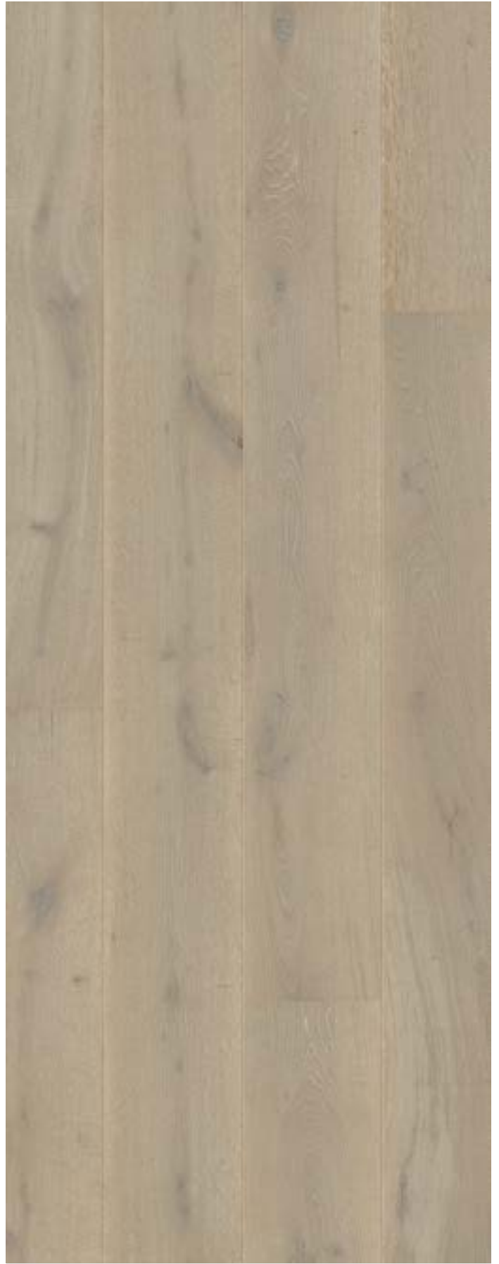
WINTER STORM OAK EXTRA MATT