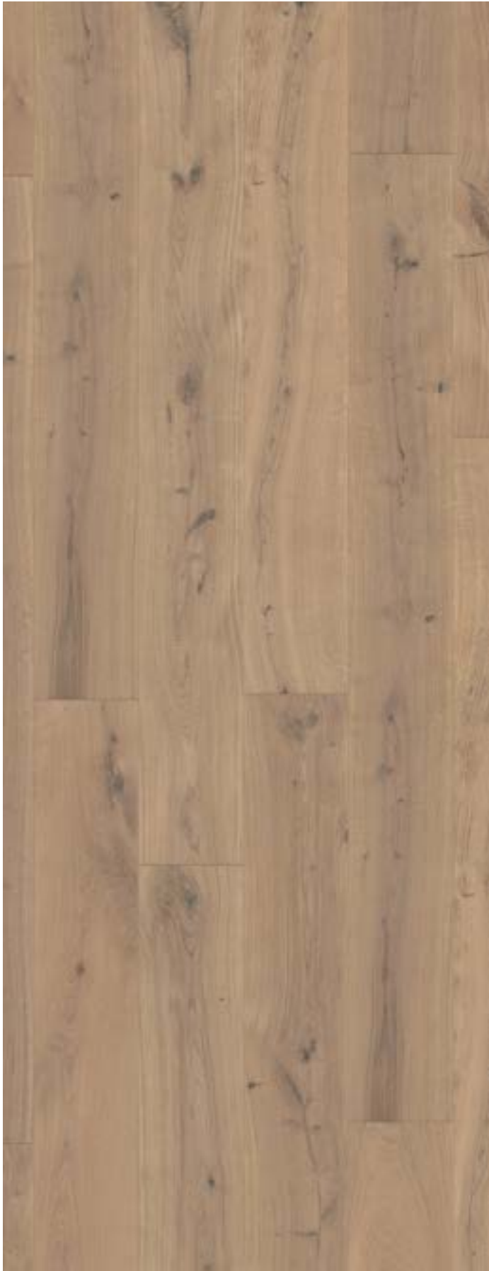
CAPPUCCINO BLONDE OAK EXTRA MATT