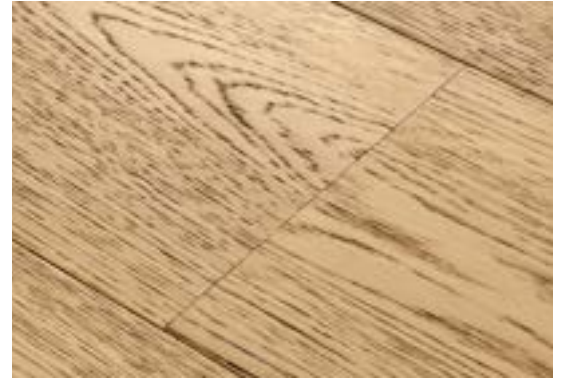
Timber without Surface & Edge Protect+ technology

Massimo is finished with an advanced lacquer to give your floor added resistance to wear, marks and scratches. The water-repellent Surface & Edge Protect+ technology also helps to prevent water, dirt and grime from being trapped in the open grain or penetrating between the joints of your floor. This helps to keep the planks looking as good as new. Thanks to the unique combination of this technology and our authentic floor designs, you will be able to enjoy your floor's beauty for years to come.