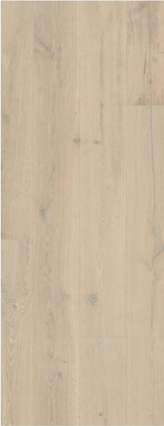
FROZEN OAK EXTRA MATT