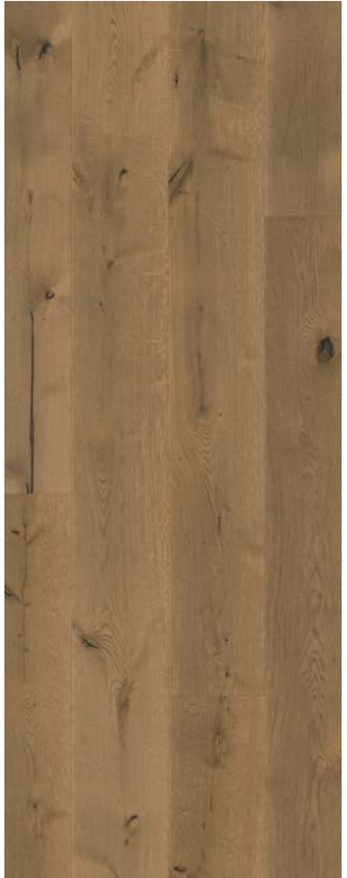
DARK CHOCOLATE OAK EXTRA MATT