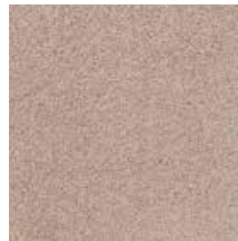
Longitude 131 SC