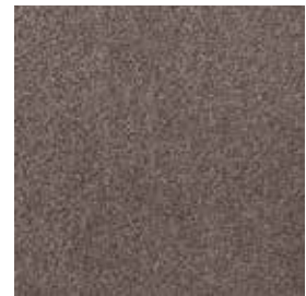
Ningaloo Reef PL