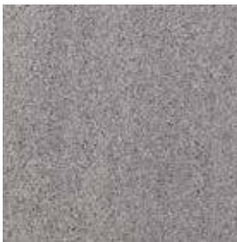
Halcyon House SF