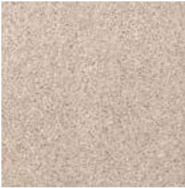
Captains Rest BG