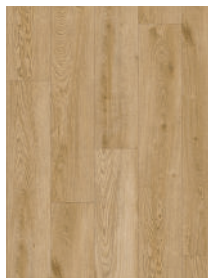
140 Dawn Oak