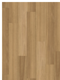
320 Seasoned Spotted Gum