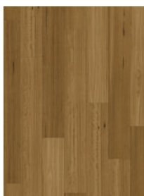
250 Grand Blackbutt