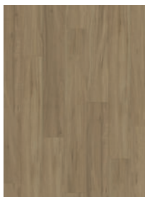
430 Select Tassie Oak