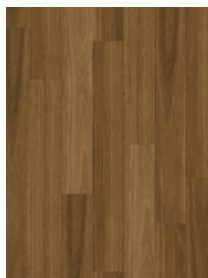
350 Natural Spotted Gum