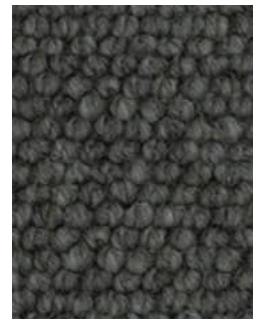
795 Industrial Grey