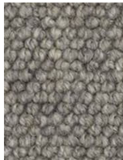
765 Aged Pewter