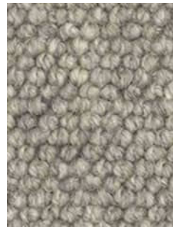
740 Winter Mist