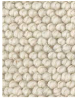
536 Coastal Dune