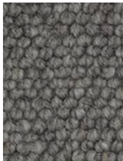
750 Coal Ash