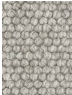
735 Dove Grey