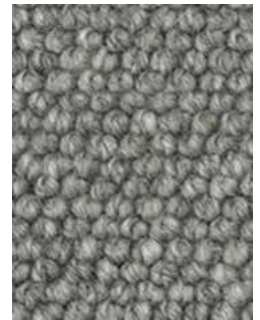
745 Evening Grey