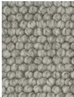
725 Oyster Shell