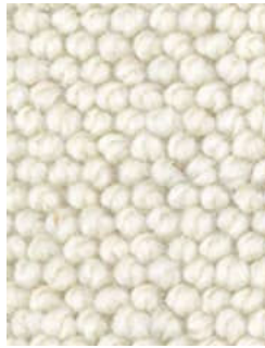
505 Sea Pearl