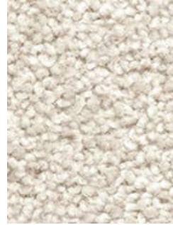
565 Balsa Stone