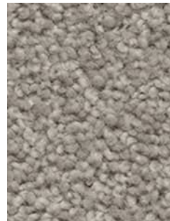
735 Dove Grey