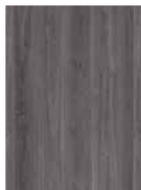
790 Tidal Oak