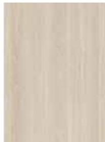
500 Cove Oak