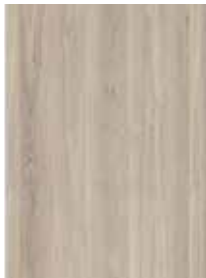
510 Whisper Oak