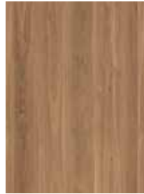
170 Pecan Oak