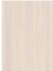
110 Driftwood Oak