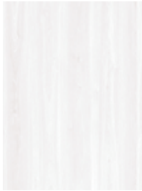
100 Mystic Oak