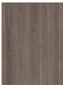
730 Mountain Oak