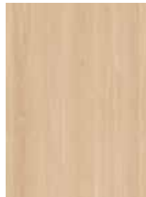
540 Sahara Oak