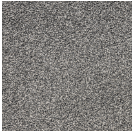
Crab Apple BEN-AG