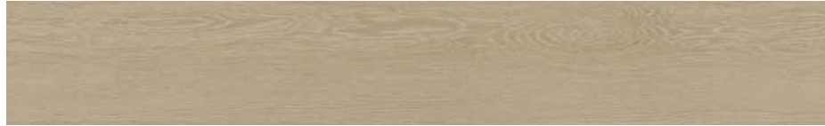
BURLEIGH OAK PAV-002-HOM