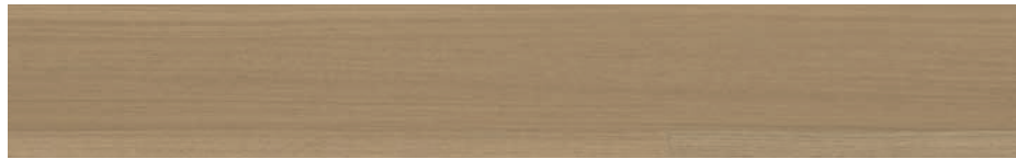
OCEAN KEYS SELECT GUM PAV-005-HOM