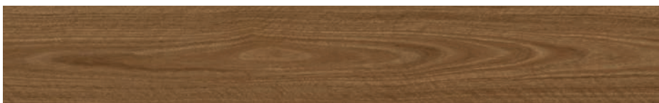
MANSFIELD SPOTTED GUM PAV-007-HOM