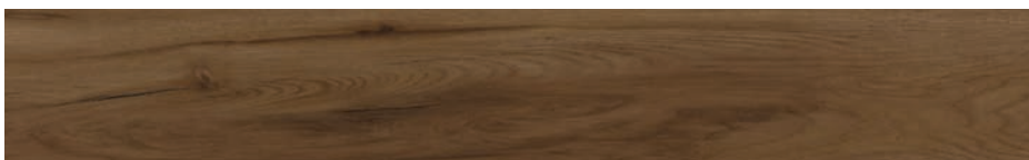
MAITLAND HICKORY PAV-003-HOM