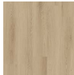
003 | Tidefall