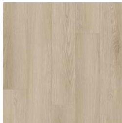
001 | Weathered

Built for effortless everyday living, it features a water-resistant finish with up to 72-hour water resistance (12mm) and 36-hour water resistance (8mm), along with excellent resistance to scratches, stains, and impact.