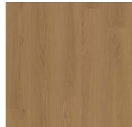
012 | Meridian