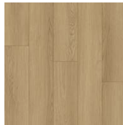
002 | Haven