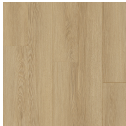
004 | Hideaway