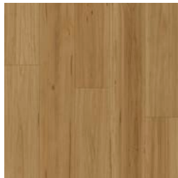
007 | Drift