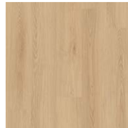
009 | Saltcut