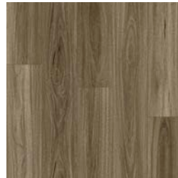
008 | Spotted Gum